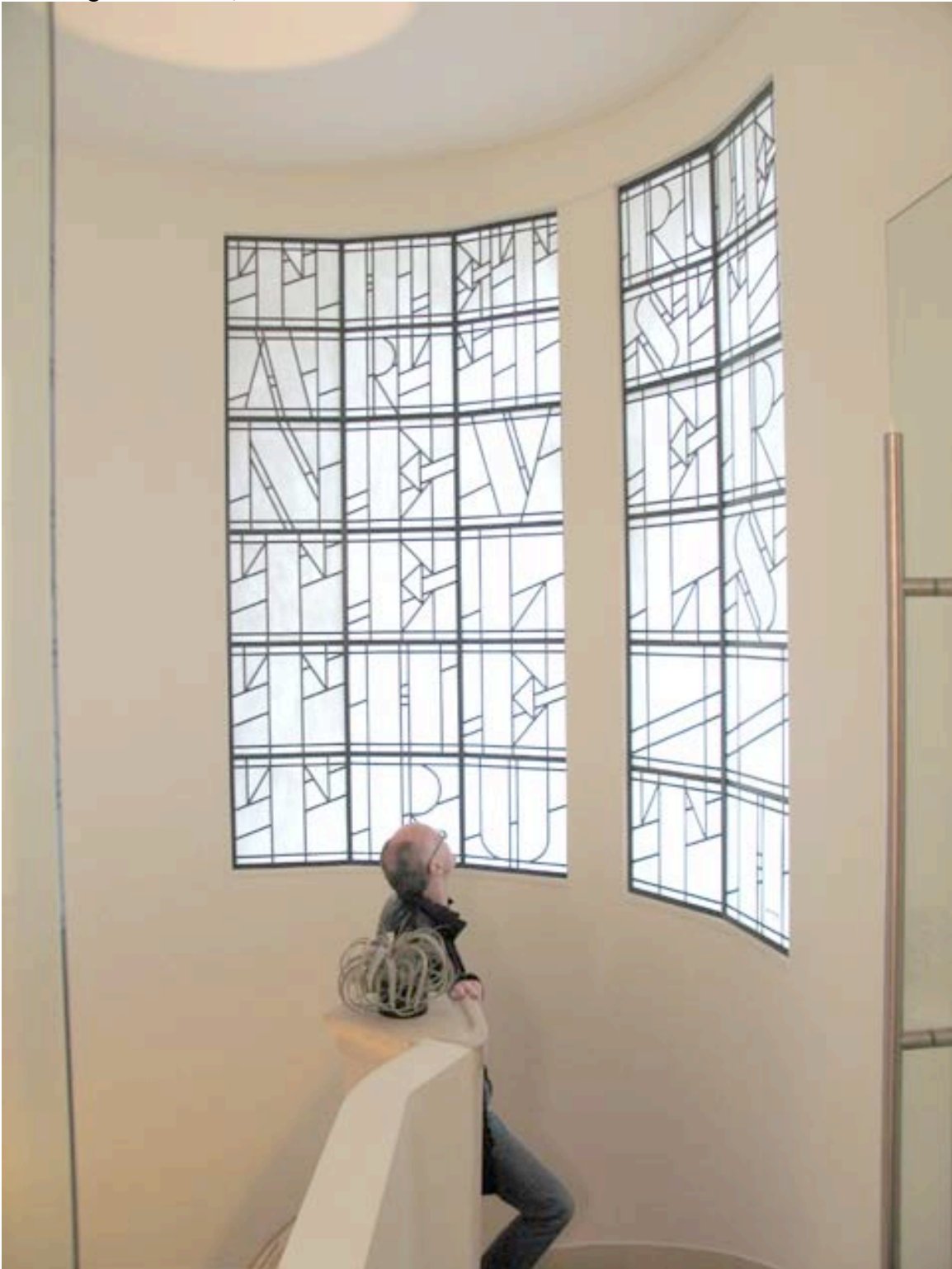
Permanent installation at Musée national d'Histoire et d'Art, Luxembourg