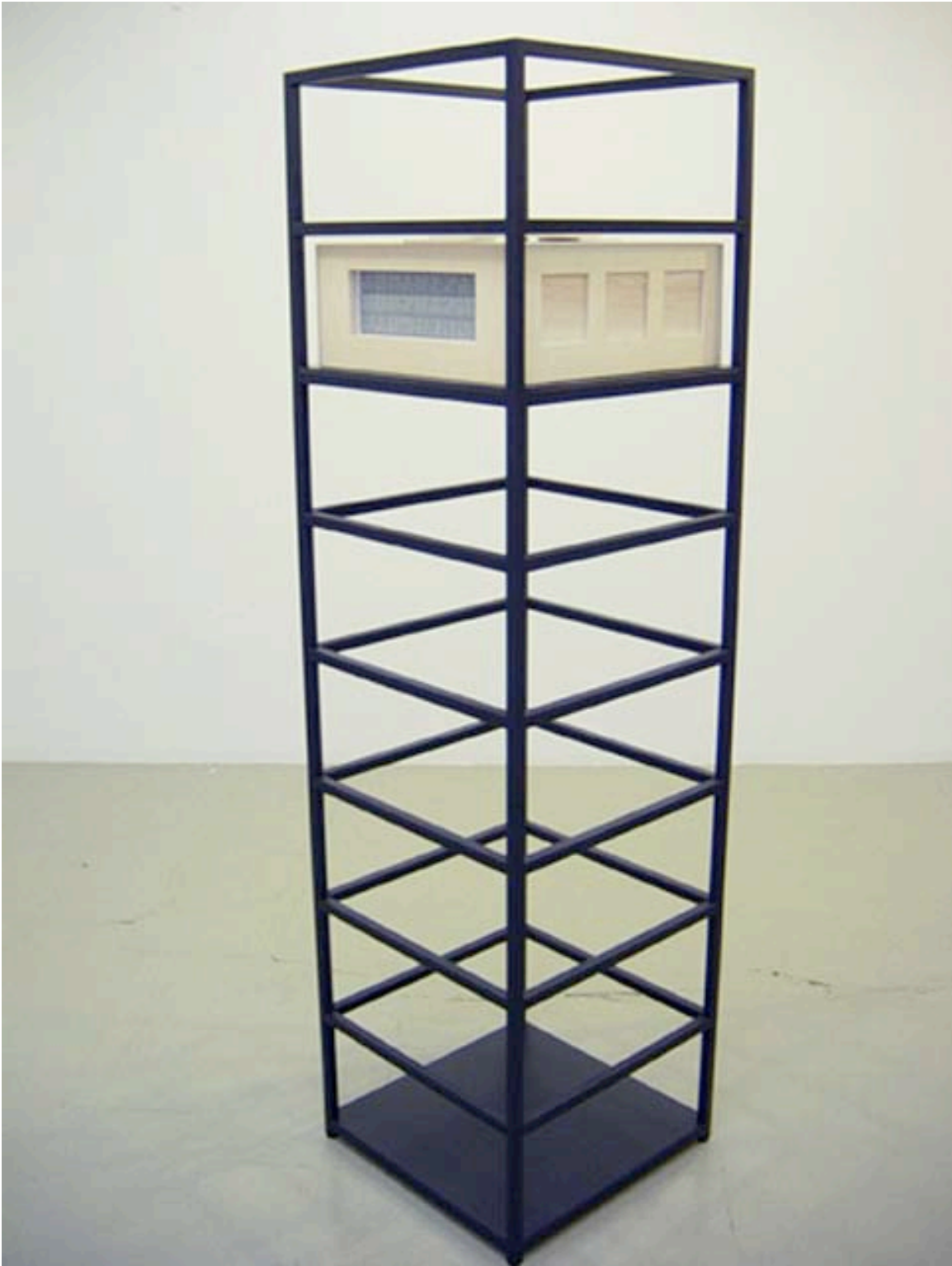
"It's not up to us to supply reality" model, 2004 176 x 45 x 45 cm