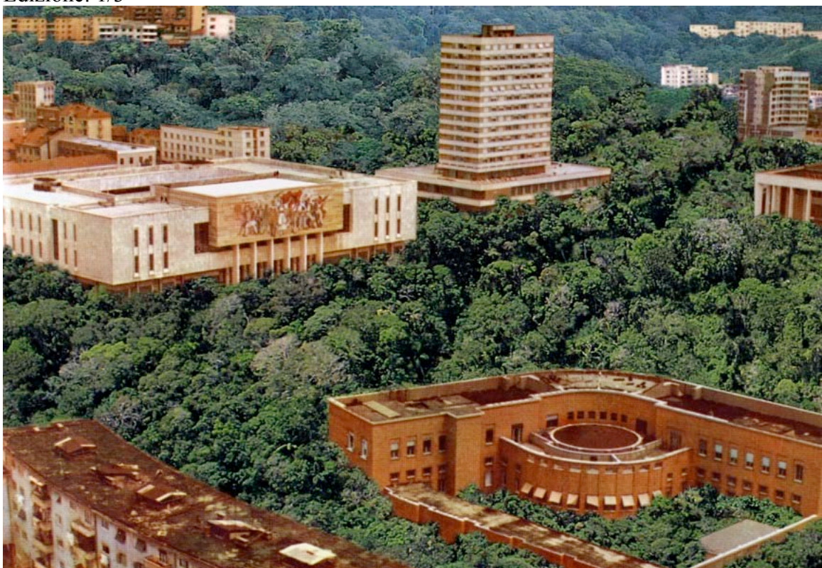
Biennale di Tirana, 2003.

"Tirana pa makina" 2003 Stampa digitale su PVC 133, 5 x 196 cm Edizione: 1/3