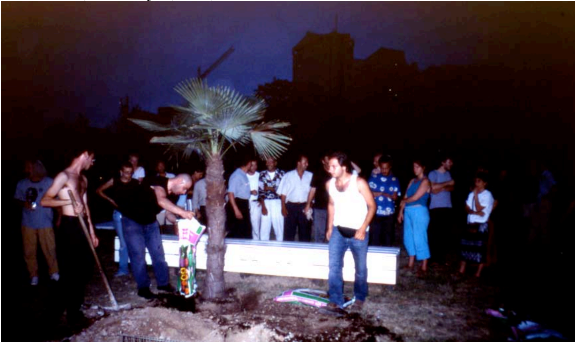
Dietro ad uno dei 3 moduli bianchi dell'installazione Untitled/Untilted viene piantata una palma.