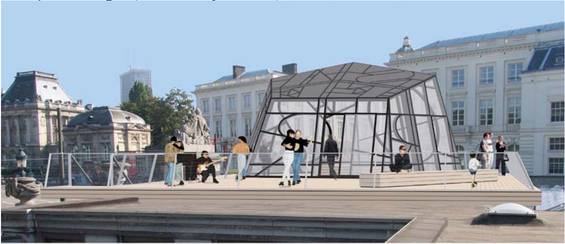
Bert Theis European Pentagon (Safe & Sorry Pavilion), Bozar, Bruxelles 2005